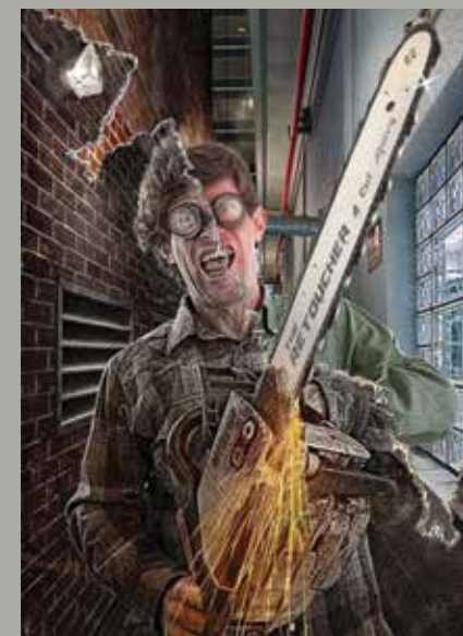
CUTTING THROUGH THE GRUNGE BY CHUCK UEBELE

THE DEADLINE FOR ENTRIES IS FRIDAY, MARCH 22, 2013.