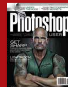
PHOTOSHOP USER MAGAZINE